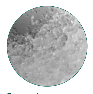
FLAKED ICE Inexpensive to produce, used in produce and fish displays.